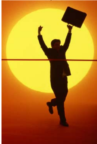
Are You Applying the Pareto Principle to Your Organization?